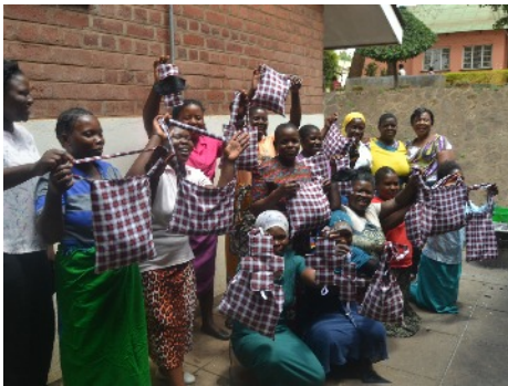
Former fistula patients - Malawi