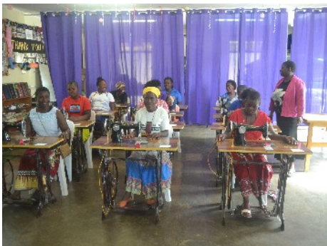
Reusable Sanitary Pad Training