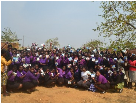
Reusable Sanitary Pad Donation